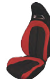
BLACK WRAP, CARDINAL FACES, PERFORATED FACES AND COMBO, CARDINAL CONTRAST STITCHING, BLACK CARBON WINGS