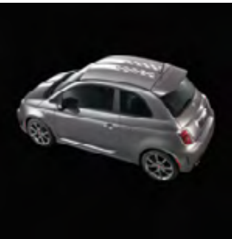
▲ ABARTH SCORPION