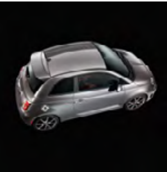
▲ RED DOUBLE RACING STRIPE