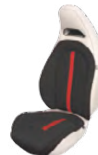
BONE WRAP, CHARCOAL PERFORATED COMBO, CARDINAL CONTRAST STITCHING, CARBON CRIMSON WINGS