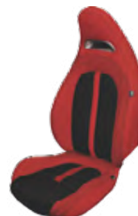
CARDINAL WRAP, CHARCOAL PERFORATED COMBO, BLACK CONTRAST STITCHING, CARBON CRIMSON WINGS