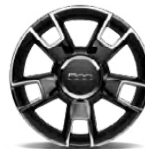
▲ 16-INCH BLACK PAINTED 5-SPOKE WHEEL WITH CHROME WHEEL INSERT