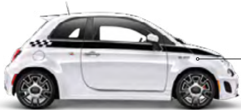
▲ BLACK RACING STRIPE