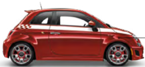
▲ WHITE RACING STRIPE