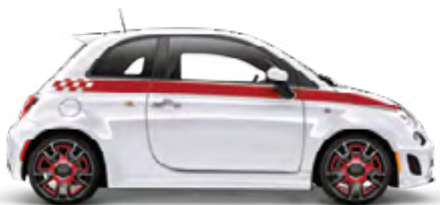
▲ RED RACING STRIPE